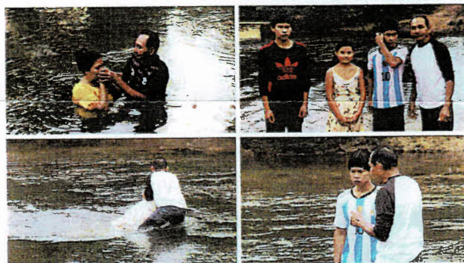
Bible studies continue to bear fruit as young people obey the gospel.

Send funds payable to "Living Water 414" to: