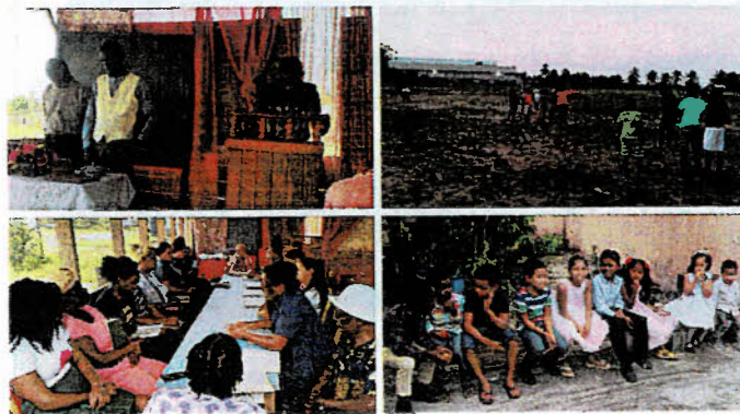
At Blueberry Hill Church of Christ—young men lead worship (top left), young people enjoy activities (top right), ladies fellowship together (bottom left), and small children await snacks (bottom right)